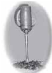
Half Goblet w/Candle $4.00 each