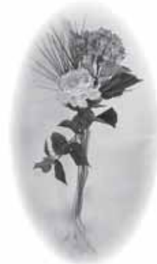
A Vase of Seasonal Flowers $5.00 each