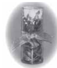
A Vase of Roses $5.00 each