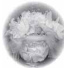
Bridal Bouquet $4.00 Each

Votive w/White Candles To Enhance Any Centerpiece $ .50 each